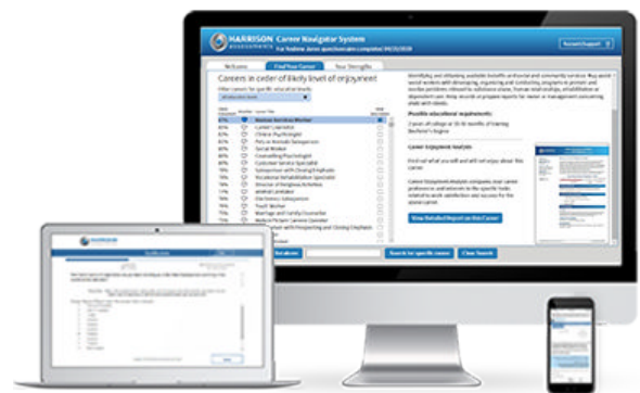
Online Interactive Career Portal